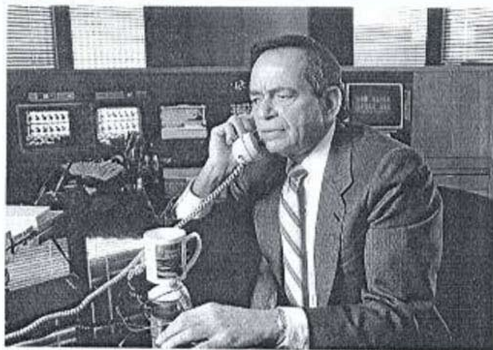
An inventor of the S&P 500 index future, Leo Melamed of the Merc. warns that overzealous regulation could drive the futures market offshore, just as it did Eurobonds.

The larger argument of those who disapprove of speculation is that it will undermine investors' confidence in the markets, imperiling the ability of companies to raise capital. Yet the number of individuals entering the market, at least through mutual funds, has been growing rapidly through the recent "speculative" era, as have new securities issues, which have increased 360% between 1980 and 1986.